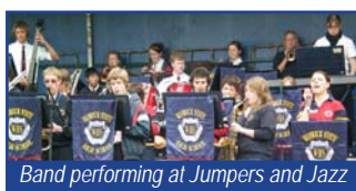
Band performing at Jumpers and Jazz

Students in our school's Instrumental Music Band Program participated in a number of performances as part of the Jumpers and Jazz in July Festival. Both the Stage Band and the Big Band performed a lunch time concert outside