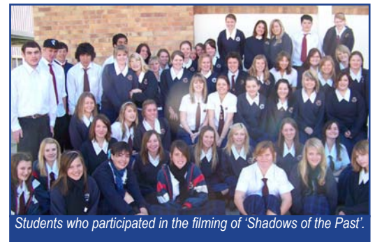
Students who participated in the filming of 'Shadows of the Past'.

the participating students' behaviour, cooperation and patience during the two days of the Filming and the students thoroughly enjoyed the experience and insights gained. 'Shadows of the Past' is slated for release at independent theatres in Easter 2009. Congratulations to all the students involved.